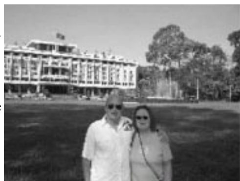
Former South Vietnam Presidential Palace, now called the "Reunification Palace".