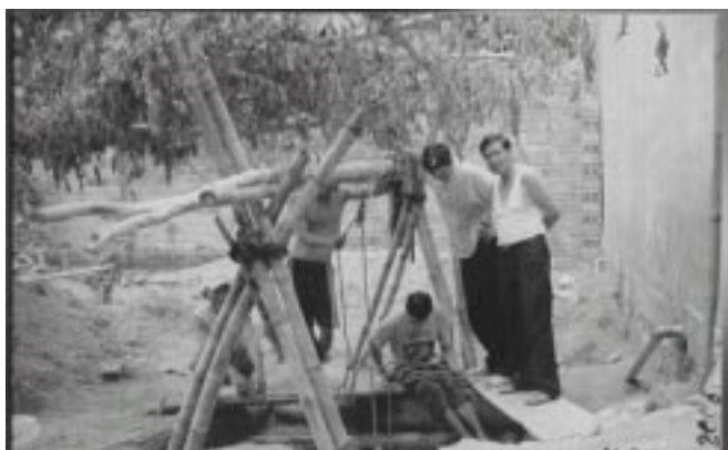
Water well under construction in Phu Yen province

Project Manager, Open Hands & Hearts- Missions to Vietnam