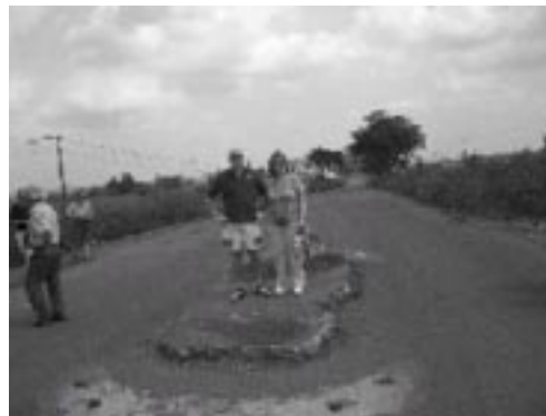
This is the location of the guard post at the entrance to Camp Enari, Pleiku where I was stationed for my first six months in Viet Nam. Not much left now.

We are looking forward to the next reunion in 09. Bill Babcock, A/3/8 RVN 69-70